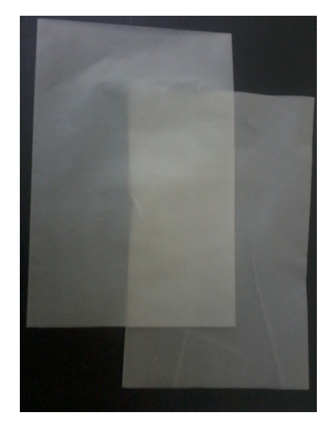
Fig. 2 PhilMech-FiC biodegradable fruit bag

The PHilMech-FiC fruit bag is made of cassava starch and polybutylene succinate (PBS). It measured 6 x 8 inches and with a thickness of 150 microns (Fig. 2). The biodegradable fruit bag was developed using a twin-screw extruder and blown film extrusion machine.