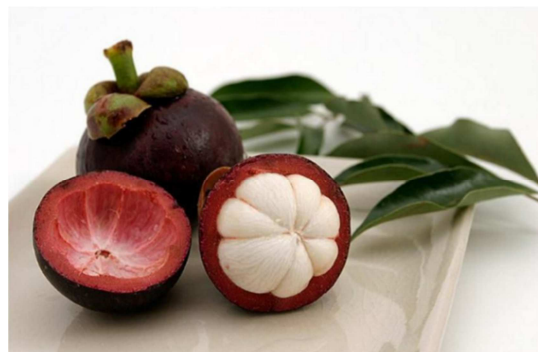
Fig. 2 Mangosteen Fruit

The egg quality can be produced by optimizing and improving the function of the digestive tract in absorbing nutrients by using feed additives. But the use of additive feeds such as antibiotics continuously can cause residues in livestock products. Because it is necessary to look for substitute materials that can function as an additional feed to improve egg performance and quality and be safe for consumers. One alternative method is the use of herbs, one of which is the mangosteen peel, as in Figure 2.