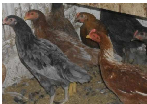
Fig. 1 The Sentul

Sentul chicken, as in Figure 1, is a local chicken from Ciamis region in West Java, which is a dual-purpose type, can utilize for eggs and meat production. They can adapt to the environment, and it remains productive even though their diets are low in quality. They produce 120-140 eggs per year [1]. Efforts can be made so that chickens can produce optimally and produce quality eggs.