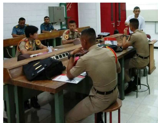
Fig. 6 Strengthening Through Automotive and Electronics Training

Strengthening naval academy cadets (AAL) (figure 4) through Information Technology, including E-learning training. Improving the user's ability to participate in educational learning systems that display information through information technology devices is important. The training was guided by a Naval Information and Data Processing Department.