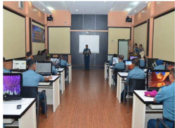
Fig. 4 Smart Class

Facilities and infrastructure for strengthening cadets through information technology are sufficient because Wi-Fi and LAN support them. Nadeak [19] argues that the strengthening unit must have adequate and relevant facilities and infrastructure to support implementing its programs, managing, utilizing, and maintaining facilities and infrastructure efficiently and effectively. Provide buildings, lecture halls, laboratories, and spaces. The library provides computer facilities to support training programs, studies, and laboratory programs in the testing room and the field and ensure the sustainability of procurement, maintenance, and proper utilization of facilities and infrastructure.