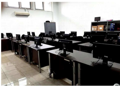
Fig. 2 Computer Lab

5) Facilities and infrastructure : Strengthening the cadets of the naval academy through Information Technology has been support by the existence of smart classes, smart boards, and information technology laboratories that support the learning process.