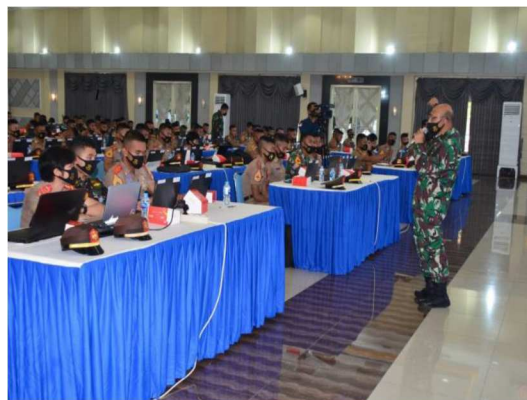
Fig. 5 E-learning Training

3) Implementation : After everything about strengthening AAL cadets through information technology has been planned, the next stage is implementation. This activity describes the implementation of the AAL's cadets strengthening activity through Information Technology, its implementation elements, methods, and teaching. This implementation stage is divided into three steps: the preparatory step (administrative and educational preparation), the implementation step, and the reporting step. Figure 4-5 shows the implementation of strengthening activities.