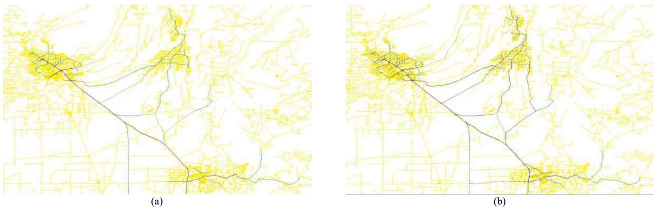
Fig. 4 Traffic volume distributions on the Butte County Road network. (a): Base scenario, normal peak hour traffic and no evacuation. (b): Evacuation scenario (evacuation vehicle trips from Paradise and Magalia, plus normal peak hour traffic in other parts of the Butte County).

Figure 4(a) shows the resulting link volume or number of vehicles per link with yellow links representing little to no traffic and darker green links representing high volume roads. For the Town of Paradise, Skyway Road, Neal Road, and Clark Road are identified as high-volume links connecting Paradise to Chico, Oroville, and the rest of Butte County.