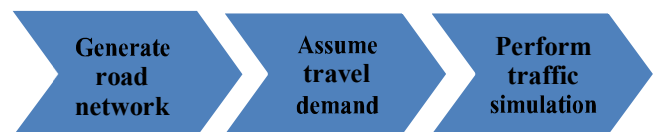
Fig. 3 Framework of the traffic simulation steps

The traffic simulation experiment design consists of two scenarios. The first is the base scenario that represents the ordinary day peak hour traffic in the study area, that is, no evacuation is considered. The second is the evacuation scenario where all residents in the wildfire-affected municipalities (Paradise and Magalia) seek to evacuate to nearby towns (Chico, Oroville and Oroville East). For the base scenario, 14,293 trips (10% of all vehicles in the Butte County, disaggregated to municipalities as shown in the last column in Table 1) are simulated to represent the peak hour traffic across Butte County. The maximum link volume is 1,592 vehicles over a one- hour time step as in Figure 4.