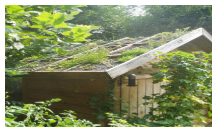
Fig.1 Green Roof

Intensive Green Roofs: Deep growing medium that is about 200 mm or greater. It requires stronger roof structure, Wide range of planting possible,