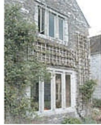
Fig.3 Green Facade

Important features for urban environment in architecture that can be used in the productive way are building facades. Current-day green facades offer the potential to learn from traditional architecture. It also incorporates advance materials and other technology to promote sustainable building functions [4].