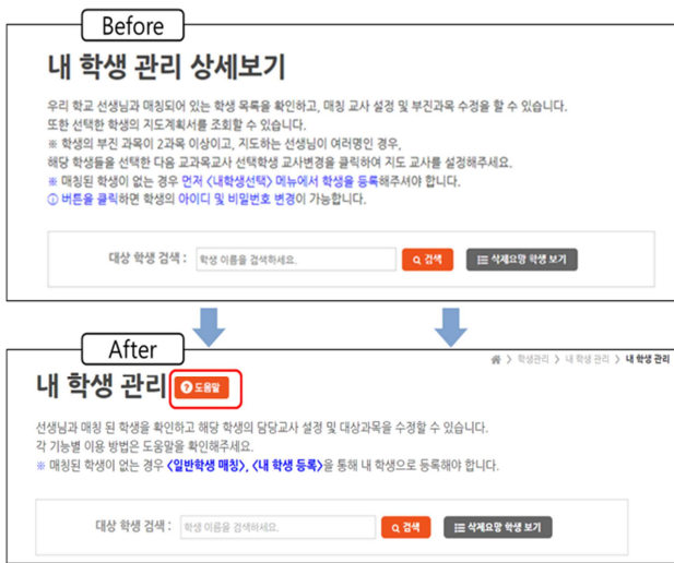
Fig. 3 Improvement of example for cognitive affordance

The second problem of cognitive affordance is the need of help(instruction). In an attempt to improve help function, we have reviewed all the help on the whole pages and removed redundant and ambiguous expressions and improved the ability to deliver more important messages. The major improvements are shown in Fig 3. In addition, for easier understanding of each function, we proposed a detailed help function that can be seen when the button is clicked.