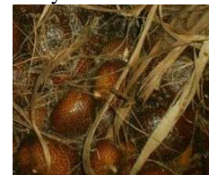
Fig. 1. Salak Pondok ( Salacca zallacca var. Pondoh ) Pagar Alam

quality and sustainable food [1]. Organic farming is one of program of agriculture sustainable. Sustainability refer to: the use of resources, the quality and quantity of production, as well as the environment. Sustainable agricultural production process will be directed to the use of biological products that are friendly to the environment [2]