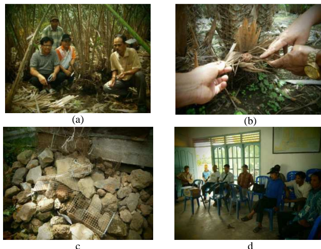
Fig. 4. An organic certification process : (a) inspection of land; (b) inspection of cultivation; (c) inspection of crop pest; (d) meeting of documents preparation

After one month from initial inspection, inspection team conduct advanced inspection to re-audit the discrepancy in the initial inspection. The end result of advanced inspection is about 5.25 ha has been declared eligible getting an organic certification. The committee LSO West Sumatra evaluate inspection result through reports and presentations inspection team. Evaluation of inspection results adjusted to ISO 6729 in 2010. Finally, the committee LSO West Sumatra decided deliver organic certification to Salak Dempo's farmer group. Coincides with the month of the quality of agricultural products in Jakarta, at 28th of November in 2012, certificate of organic awarded by Ministry of Agriculture Republic of Indonesia to Mr. Endang Effendi as a chairman of Salak Dempo's farmer group. The organic certificate valid for 3 years, where each year will conducted surveillance intended to audit land farming of Salak Pondoh Dempo. It aims to assess whether Salak Pondoh Dempo can maintain the integrity of their organic status. Some pictures of organic certification process can be seen in Figure 4.