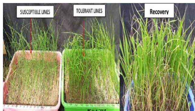
Fig. 2. The appearance of lines on the treatment of drought stress and the ability of plants to recovery grow back.

As seedling visibility shown that the plants which 7 weeks without watered, the tolerant lines kept growing well, vigorous, and the leaves remain completely open, while moderate tolerant lines showed the ends of the leaves dried up, even on vulnerable lines seen almost all the leaves rolled up, dried and wilted (Figure 2 and 3). Reference [14] reported that leaf roll being delayed on the drought-tolerant rice genotype. The rolled leaves are induced by loss of turgor and lower osmotic regulation in the rice plants, delayed leaf rolling in the tolerant genotype indicates preserved turgor and protected from dehydration. Leaf rolling mechanisms adjusted the leaf water potential to absorb soil water under drought stress [23].