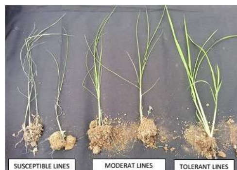
Fig. 3. Comparison of tolerant seedlings (0-1 score), moderately tolerant (score 3-5) and susceptible (score 7-9) in treating drought stress