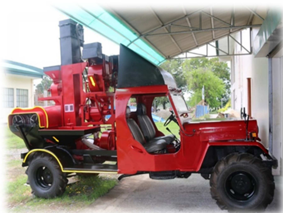
Fig. 3 The prototype unit of the developed mobile corn mill 88 %.

Based on the results of both laboratory and field trials of the prototype unit (Fig. 3), the developed mobile corn mill has an input capacity of 940-1,100 kg/h with product recovery of 66-71 % and degerminator efficiency of 82-