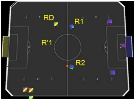
Fig 4: The R_1 avoid R_2 by turning to left side while it is moving to R_1

The R_1 will keep detecting the distance between itself and the ball while it is moving. If the distance between the ball and R_1 is less than 45, R_1 will charge the ball into the goal as shown in Fig.5.