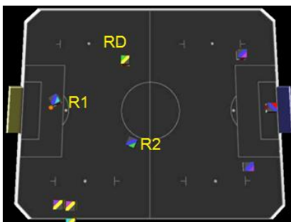
Fig 5: The R_1 successes to charge the ball into the goal

From this research we propose some algorithm for robots coordination and collaboration in soccer game. We need to set and adjust the coordinate of the robot position and the obstacle to make sure the robot can move with obstacle avoidance, passes and shooting the ball properly. The synchronization for passing time and robots movements are made the robot shoots the ball at the shooting area, at the same time. Our strategy had been tested on robot soccer simulator. The success of the robot for shooting the ball was highly depending on the speed of the ball and the robot 1 movement.