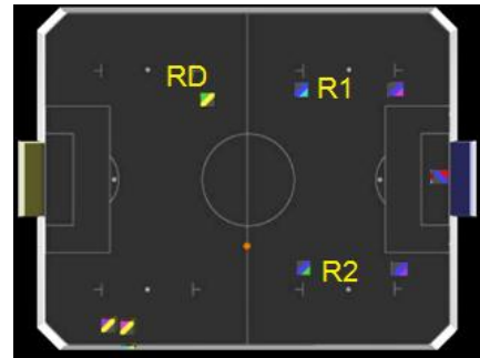
Fig 3: Position of the R_1, R_2 and R_D

To avoid the obstacle, we used control statement to control the different condition. For example when the robot position reach the x-axes larger than 45 and if robot Y detect obstacle then it will avoid clash with the obstacle.