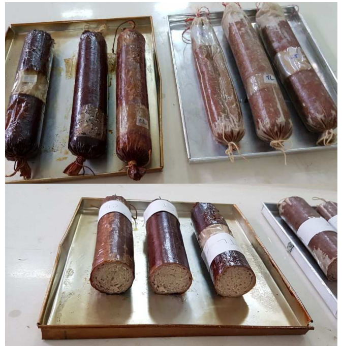
Fig. 1 Mutton Salami

two days. The curing temperature was maintained between 27-30°C with dry coconut shell used as fuel. To control the temperature, ice was added to the curing room if the heat exceeds over than 30°C.