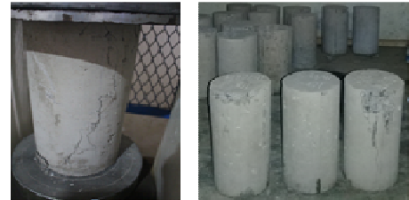
Fig. 3 Concrete after compressive the strength

The results of the comparison of the compressive strength and concrete tensile strength with the addition of fiber waste strapping bands are shown in the diagram. From the test, the following results are obtained. In the gap graded normal concrete the compressive strength value is 23.52 Mpa and the value of the split tensile strength is 1.46 Mpa. In gap-graded concrete added with strapping band waste, the optimal compressive strength value at 1.0% variation is 26.04 Mpa and the concrete tensile strength value is 2.548 Mpa.