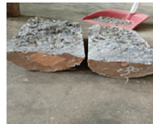
Fig. 4 Concrete after being given split tensile strength