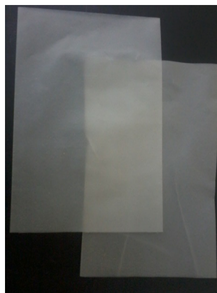
Fig. 2 PHilMech-FiC biodegradable fruit bag

The PHilMech-FiC fruit bag is made of cassava starch and polybutylene succinate (PBS). It measured 6 x 8 inches and with a thickness of 150 microns (Fig. 2). The biodegradable fruit bag was developed using a twin-screw extruder and blown film extrusion machine.