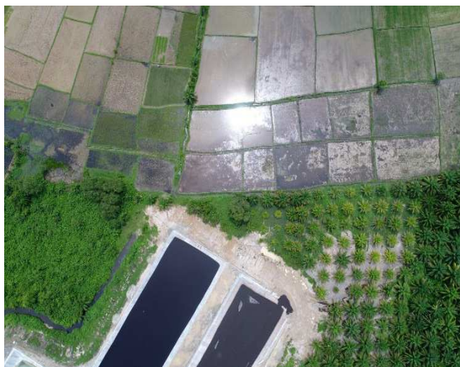
Fig. 1 Paddy soil contaminated by palm oil mill wastewater in Manggopoh Village, Agam District

The research was conducted in the soil field in Manggopoh Village, Agam District, West Sumatra, Indonesia at June-August 2018 as in Figure 1. Materials and equipment used include mineral soil drill (auger Belgium), Munsell book, GPS, sampling ring, and plastic samples. Figure 1 below shows the paddy soil which is contaminated by palm oil wastewater.