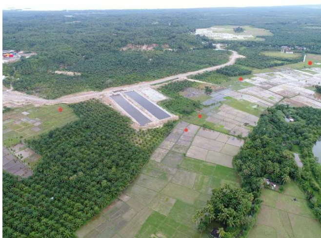
Fig.2 Location of rice field sampling contaminated by palm oil mill wastewater

The first sample was from the undamaged field upstream, while the second was from the contaminated rice field area, through land leveling from the closest point to the spill source, down to the furthest, in the direction of irrigation flow. The analysis of physical properties was performed on the uncontaminated unit, while chemical and biological evaluation was conducted on the supposed polluted filed.