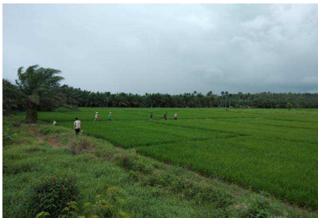
Fig. 5 Rice growth affected by wastewater spill palm in Manggopoh Village after 2 months.

The results of the analysis did not indicate any significant differences and influence on the control and the contaminated locations were due to land saturation and water circulation. This was as a result of irrigation and rain. Figure 3 shows the highest value was recorded at location 1 (control), while the lowest mean was at location 3, which was within the 200 m range of the waste pond. The graph of means grouping using Fisher's test shows palm wastewater did not significantly affect soil properties. Figure 4. show group of average value from Fisher's test; the value of the nature of the high ground is more likely to be in the positive zone. Meaning the change in soil properties is not too full due to palm waste. Besides, several studies have reported its capacity to be used as organic fertilizer, and Figure 5 shows the effect on the growth of rice for 2 months.